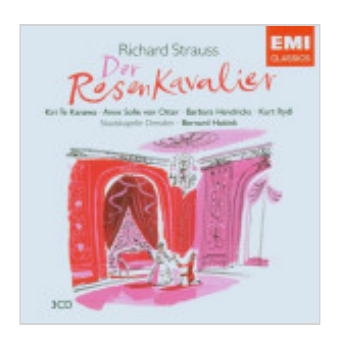
Strauss: Der Rosenkavalier Bernard Haitink, Staatskapelle Dresden