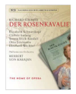
Der Rosenkavalie Elisabeth Schwarzk

(/uk/store/products/12915434703)/store/products/14476749(366)/store/products