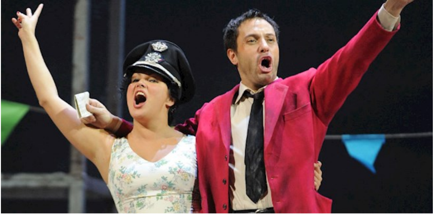
Opera stars Anna Netrebko and Erwin Schrott, who separated in 2013.