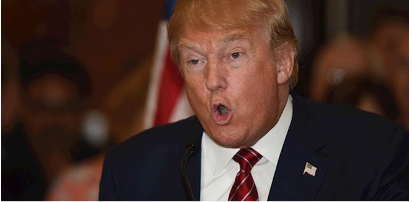
Donald Trump